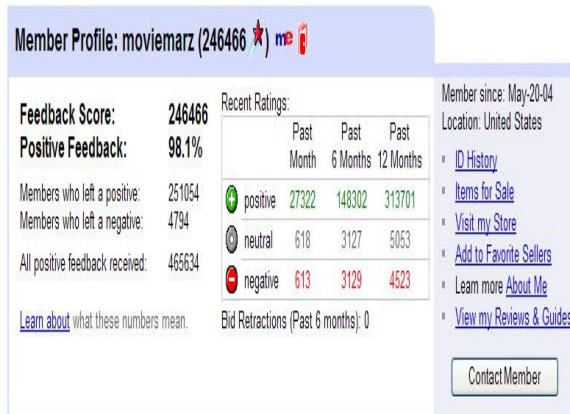
Figure 1. ebay Feedback System